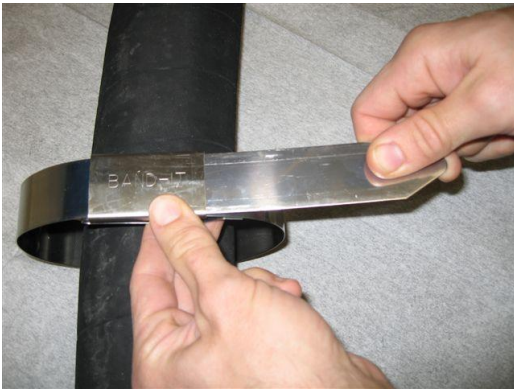
1. Pass band around product and through sealing clip