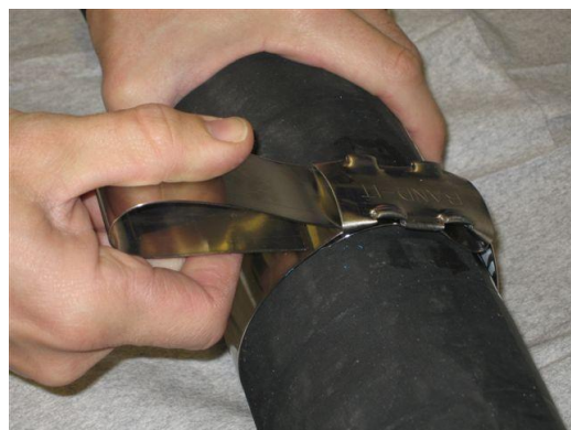
6. Fold tail back under towards clip to shield sharp edge.

In the interests of good health & safety practice, suitable safety clothing should be worn during the installation of clamps.