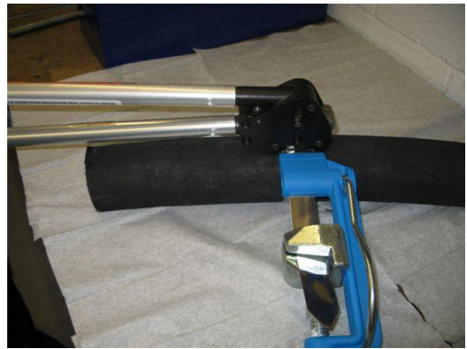
4. Crimp sealing clip.