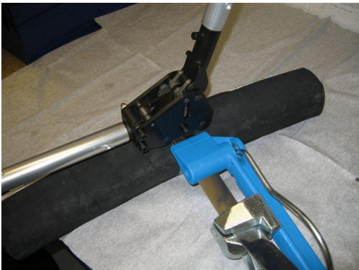
3. Once desired tension is achieved, apply Manual Sealer (Ref X80302 for 32mm / Ref X80307 for 19mm) to sealing clip.