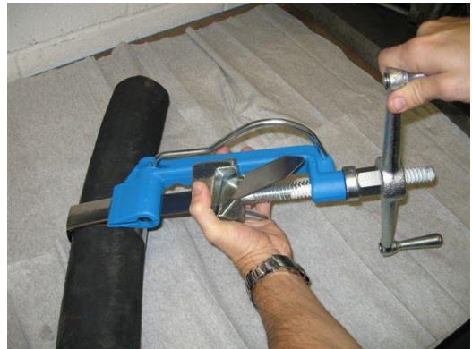
2. Tension using Manual Tensioner (Ref G402 for 32mm wide clamps, Ref C001 or C003 for 19mm wide clamps).