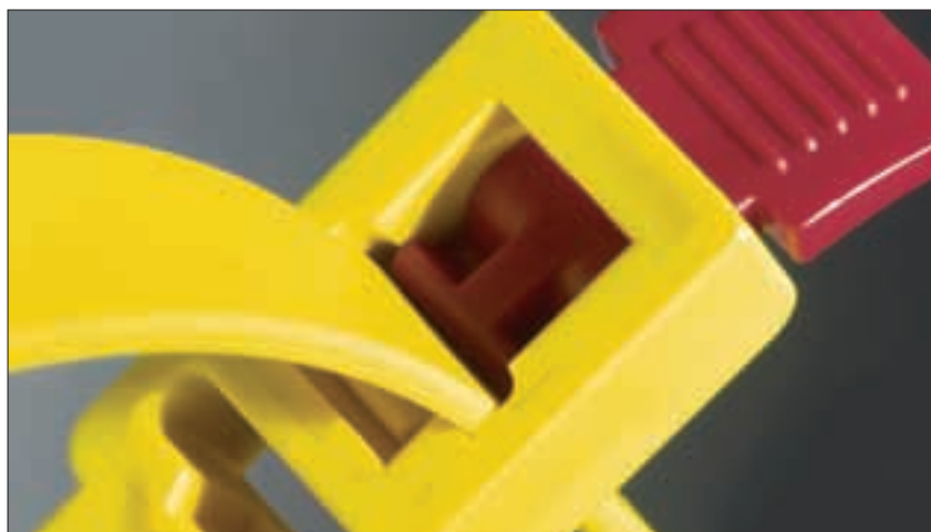
Patented quick release mechanism for quick and easy application.

The versatility of the SpeedyTie® means that it is suitable for a multitude of applications. Originally developed for the "offshore" industries, other uses include: construction, electrical installations, scaffolding sheet installations, exhibitions, trade fairs, and many more.