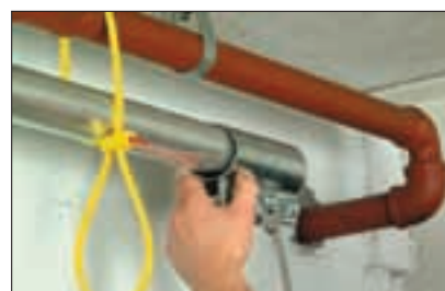
SpeedyTie® is particularly suited for temporary but safe bundling or fixing.