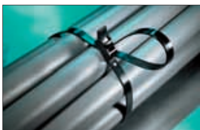
SpeedyTie® - Quick and easy.