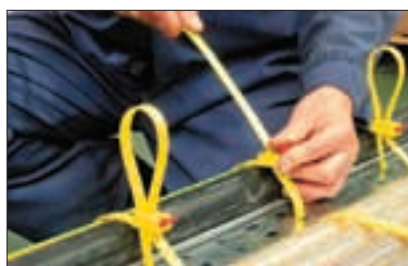
Excess Tails can be neatly tucked away.