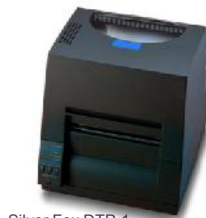
Silver Fox DTP-1