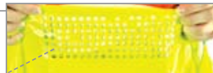
PVC Nomex ventilated back flap.