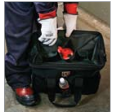
Wide Mouthed Opening

Salisbury, continuing to exceed industry standards.