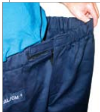
Elastic waistband for maximum comfort.