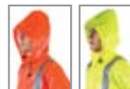
Available in florescent orange or yellow.