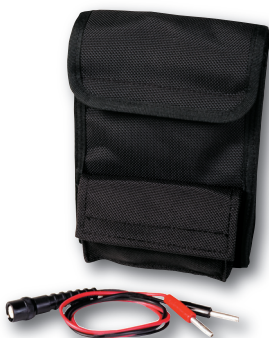
Complete with tool-belt holster and test leads