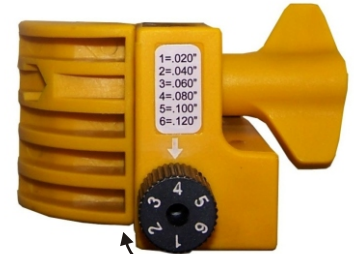
Knob A: Rotate CW to #1

The tool is designed with two adjustment features. The sliding jaw secures cables of various diameters. The indexing blade depth control allows precise blade depth settings for different insulation thicknesses.