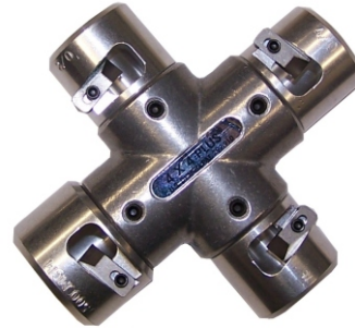
4 X 4