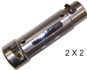
2 X 2

Note: This tool is designed to strip 45 Mil to 110 Mil XLPE and EPR insulations. Insure that the proper cutting head (bushing) has been selected for the wire you are using. Both tools use the same bushings.