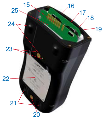
back and inhousing components*