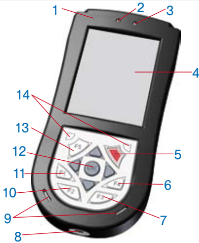
Front and bottom panel components