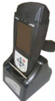
i.roc 420 with scannermodule and optional handgrip inserted in dockingstation