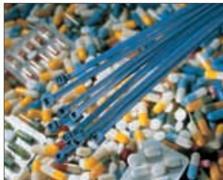
A safe and contamination free production process with MCT.