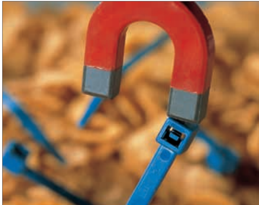
The MCT with metal content.

The Metal Content Tie is a cable tie specifically designed for use in the food & pharmaceutical processing industries. A unique manufacturing process, involving the inclusion of a metallic pigment, enables even small "cut-off" sections of the tie to be detected by standard metal detecting equipment. Ideally suited for the installation of cabling in and around the manufacturing process.