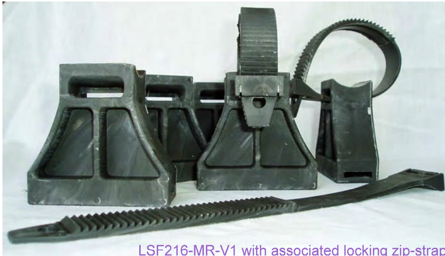
LSF216-MR-V1 with associated locking zip-strap