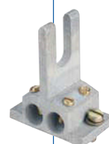
TC - Tunnel Connector