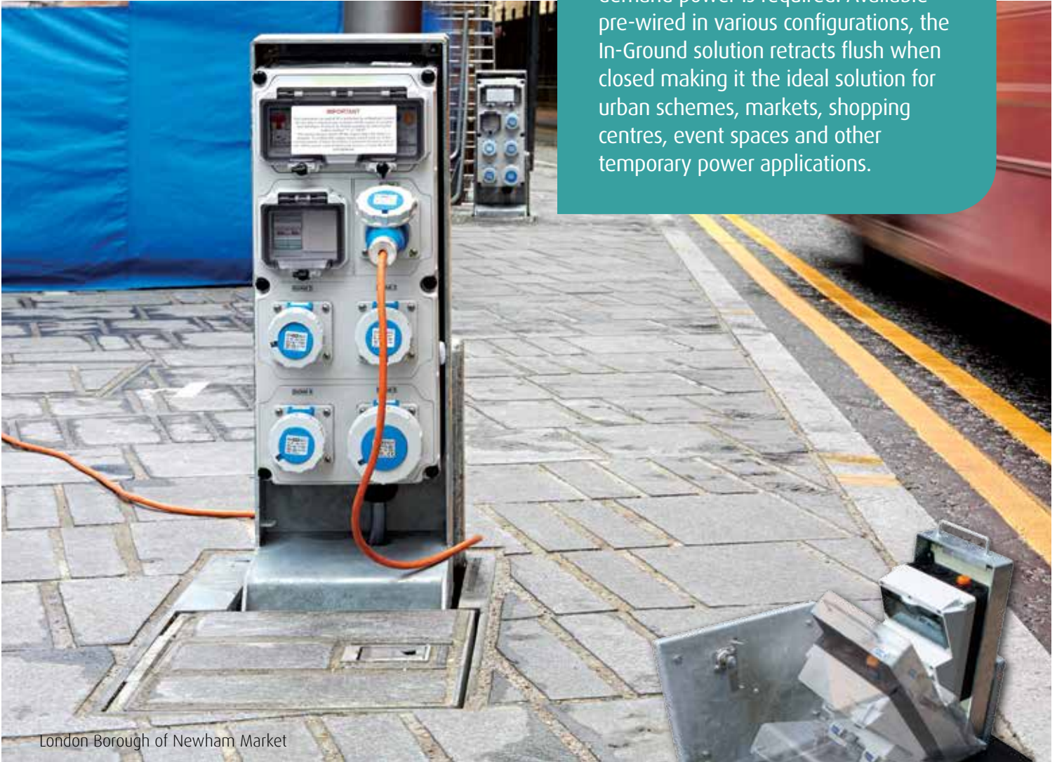
London Borough of Newham Market

The Westminster range of In-Ground distribution pillars meet a wide range of applications where discreet, on-demand power is required. Available pre-wired in various configurations, the In-Ground solution retracts flush when closed making it the ideal solution for urban schemes, markets, shopping centres, event spaces and other temporary power applications.