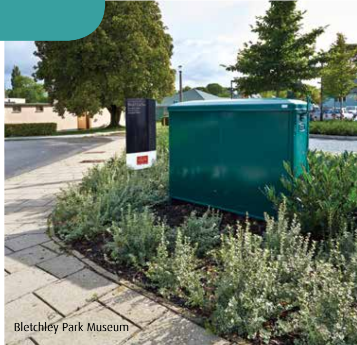
Bletchley Park Museum