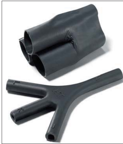
573H532-535 Series supplied / fully recovered.

This style provides strain relief, sealing and mechanical protection on cable harness breakouts or transitions.