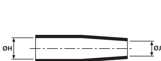
a: Expanded form (supplied)