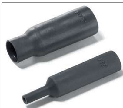
313E445-457 Series supplied / fully recovered.

This part is normally used to build up or shim a cable diameter to facilitate a better fit for components in a cable harness.