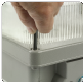
Screwed bezel fixings