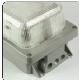
Integral mounting feet