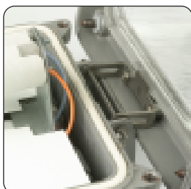
Hinged lens opening