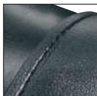
RTC with countersunk seams