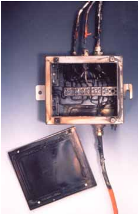
SX Range Enclosure and Cables after IEC331 Fire Testing