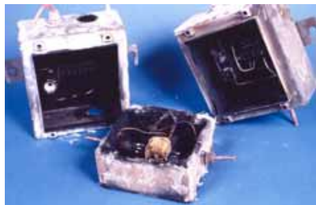
SX and BPG Range Enclosures after BS6387 Testing