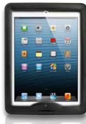
XCRiPadMini without nylon case (Only usable outside hazardous area!)