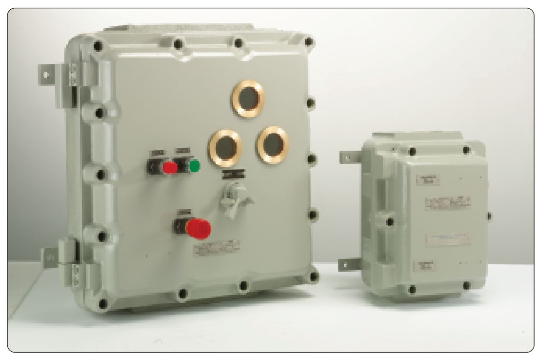
G27 and G23 control panels