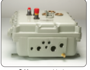
arter isolator Cable entry positioning

WWW.CABLEJOINTS.CO.UK THORNE & DERRICK UK TEL 0044 191 490 1547 FAX 0044 477 5371 TEL 0044 117 977 4647 FAX 0044 977 5582 WWW.THORNEANDDERRICK.CO.UK