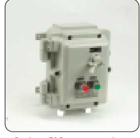
Socket G23 starter isolator