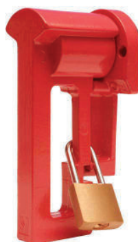
Locking system allows several individual padlocks to be inserted