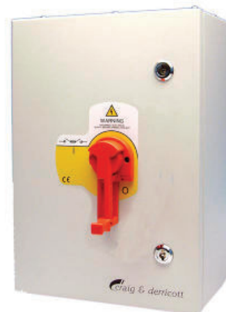
Typical Assembly with a grey Copon finished enclosure