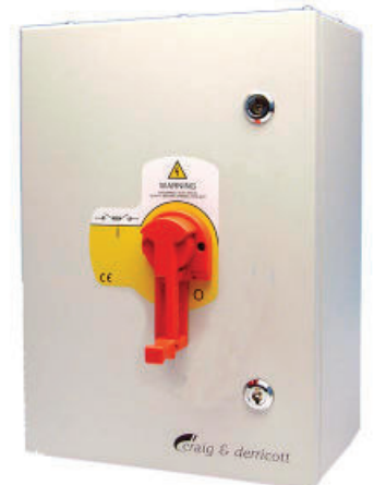
Typical Assembly with a grey Copon finished enclosure

To call for padlocking in both 'Off' & 'On' positions, add suffix '10' to the catalogue numbers as shown above. - e.g. DCG2003LUL10