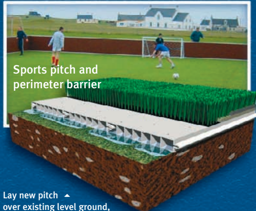
Sports pitch and perimeter barrier

Lay new pitch ▲ over existing level ground, save time and money.