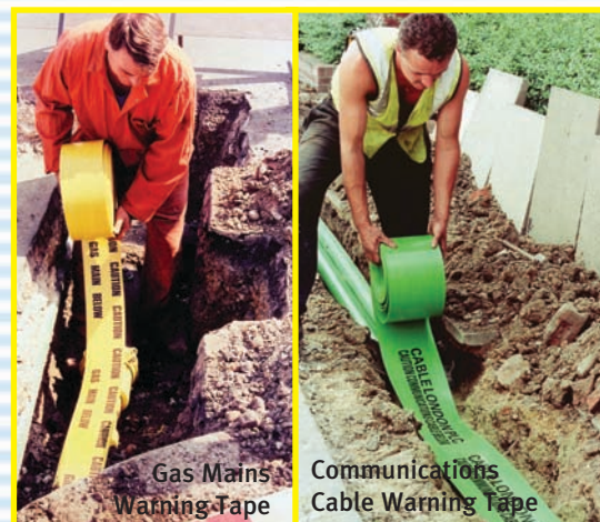
Gas Mains Warning Tape