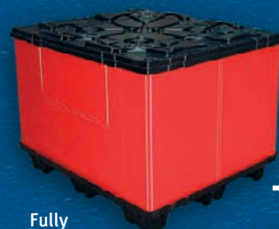
Fully collapsible pallet sleeves