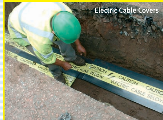
Electric Cable Covers

Approved by utilities worldwide. Stokbord Cable Covers meet the impact requirements of BS2484, 1985 Paragraph 4 Appendix A. Complies with EATS 12-23