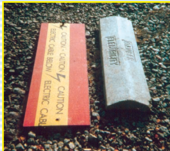
▲ STOKBORD® alternative to the traditional concrete protection (shown right)