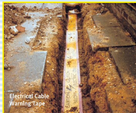
Electrical Cable Warning Tape

Approved by utilities worldwide. Centritile® warning tape complies with EATS 12-23