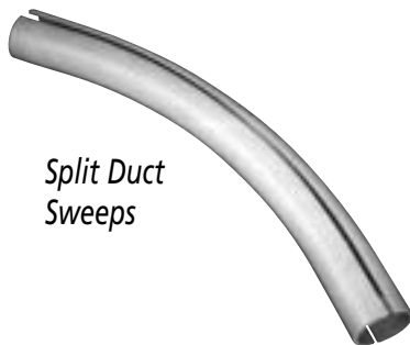
Split Duct Sweeps