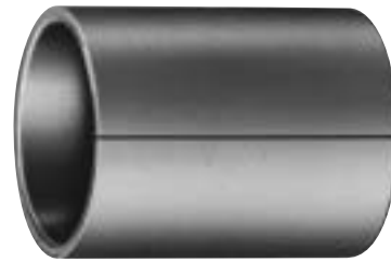
Split Sleeve Coupling For joining Split Duct to existing duct.