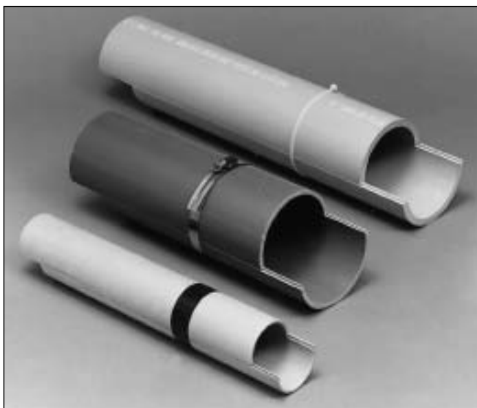
The fast and easy method of installing duct around existing cable for repair and temporary installations.

Available in 2" through 6" diameters, this product line also contains couplings and sweeps necessary to complete the system.