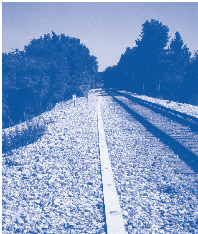
Wall thickness nominal 10mm

BCM ground cable channel is available in standard two metre lengths and in box sizes ranging from 100mm up to 350mm. Approximately one fifth of the weight of precast concrete yet strong enough to overcome the possibilities of breakage. The channels lightweight characteristics means that a four man team can install GRC channel at twice the speed of traditional concrete. Easier site delivery and movement to trackside also help cut time and labour costs.