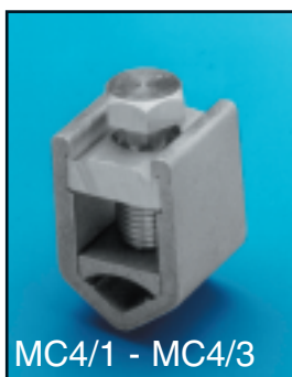
MC4/1 - MC4/3