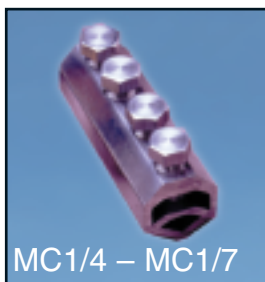
MC1/4 – MC1/7