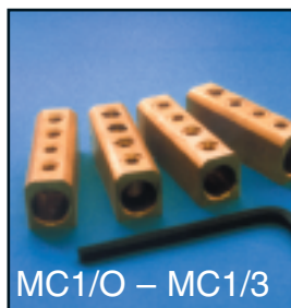
MC1/O – MC1/3