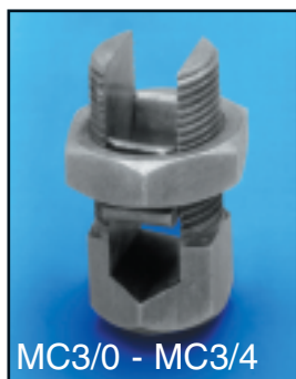
MC3/0 - MC3/4