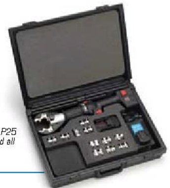
Plastic case type VAL P25 for storing the tool and all accessories