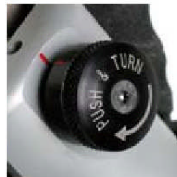
Quick jaw change pin