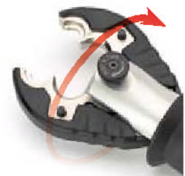
Jaws rotate 180°