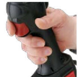
Sculptured body for optimum comfort