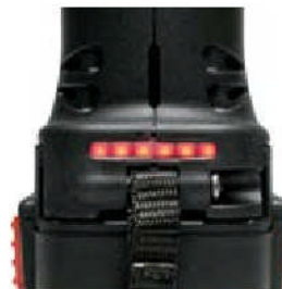
Battery condition display