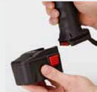
Automatic slot-in battery

These tools are supplied without dies. For die selection, please refer to chart on pages 150 to 156