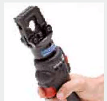
Sculptured body for optimum comfort

These tools are supplied without dies. For die selection, please refer to chart on pages 150 to 156