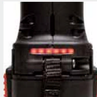
Battery condition display