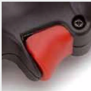
Switch ergonomically designed