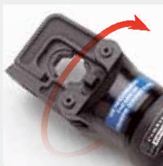
Head rotates 180° for ease of operation