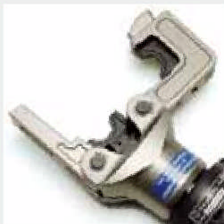
Wide-opening head, ideal for derivations from running conductors

Durable moulded body offering high resistance to wear and damage in all operating conditions