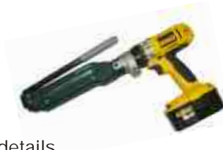
UL 4000 Battery Operated Tool See page 12 for details