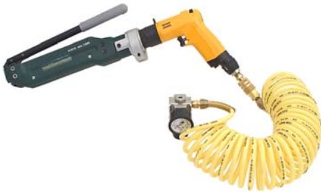
UL-X69001 Ultra-Lok® Pneumatic Tool