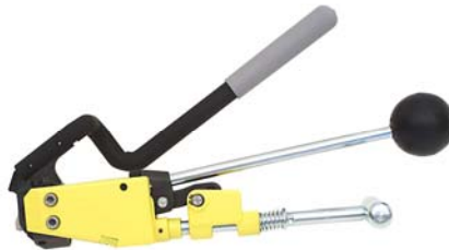
UL-T300 Ultra-Lok® Manual Tool