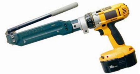
UL4000 Ultra-Lok® Rechargeable Portable Tool