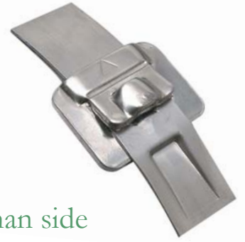
Ultra-Lok® Completed Lock