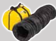
SAFD20/05-EX (5 metres long) SAFD20/10-EX (10 metres long)