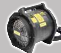
SAF30-EX Portable 30cm Fan