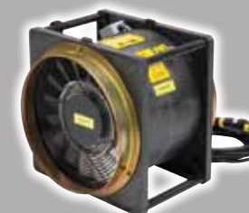
SAF40HP-EX Portable 40cm Fan