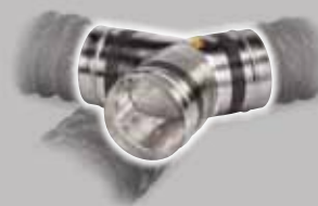
SAFD30/YC Y Coupler