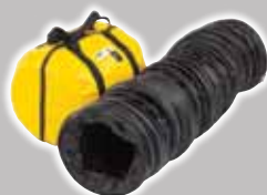
SAFD30/05-EX (5 metres long) SAFD30/10-EX (10 metres long)