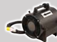
SAF20-EX Portable 20cm Fan