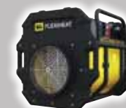
SAPH15/400 ATEX Heater