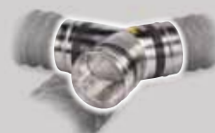
SAFD20/YC Y Coupler