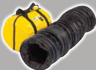
SAFD40/05-EX (5 metres long) SAFD40/10-EX (10 metres long)