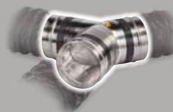
SAFD40/YC Y Coupler