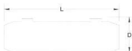
72-N1, 72-N2, 72-N3