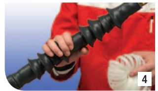
4 Once the inner core has been fully removed, the termination installation is complete!