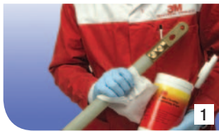
1 Prepare the cable as normal and clean with 3M™ Cable Wipes