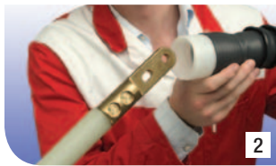
2 Place the 3M™ Cold Shrink termination body over the cable end and position at the correct point on the cable