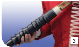
3 Begin to remove the inner core, allowing the termination to shrink down onto the cable