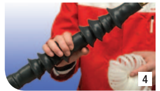
4 Once the inner core has been fully removed, the termination installation is complete!