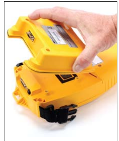
3M™ Dynatel™ All-in-one Modem Module VDSL2

VDSL AUTO mode automatically connects at the highest possible connect rate/service type (i.e. VDSL2, VDSL, ADSL2+)