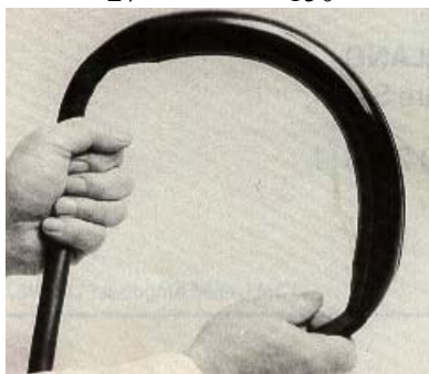
Excellent flexibility in completed joint.