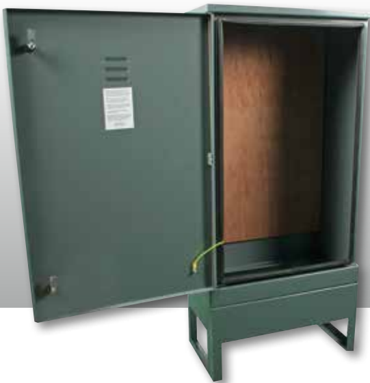
Plinth sold separately for quick installation in soft verges

« LOCK TYPE – should the standard tri-key cam lock not be suitable, please specify your lock type for Ritherdon to source and price