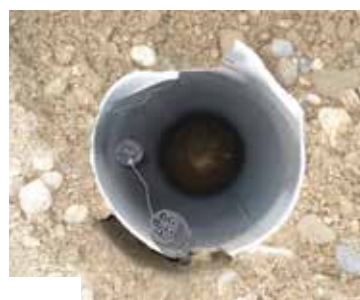
Poleplug female socket after vehicle impact and plug breakaway.