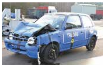
The car after a 100 kph crash test with the Ritherdon cabinet