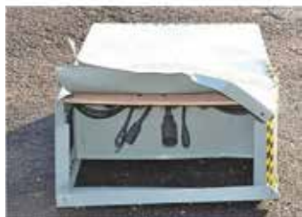
The cabinet after the 100 kph impact showing the separated "PolePlugs"