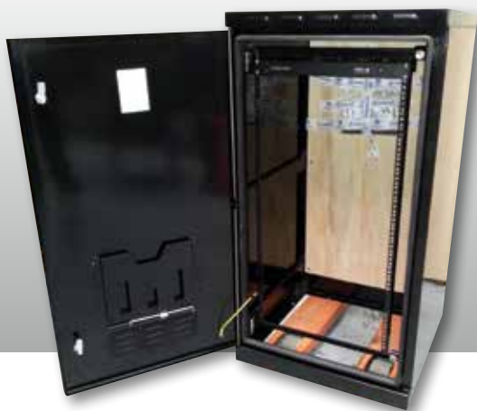
11" or 19" fixed or swinging rack units