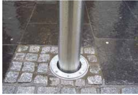
Orion Pole Retention Socket