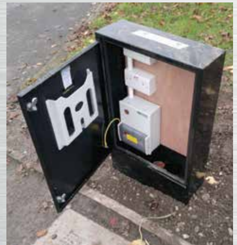
Cabinet built to customer specifications

“Ritherdon designed a specialist cabinet for PIPS Technology with plug points and consumer units, which are used for a number of our Police ANPR installations across the UK.”