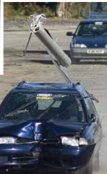
Used in conjunction with Ritherdon passively safe cabinet.