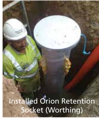
Installed Orion Retention Socket (Worthing)

WWW.CABLEJOINTS.CO.UK THORNE & DERRICK UK TEL 0044 191 490 1547 FAX 0044 477 5371 TEL 0044 117 977 4647 FAX 0044 977 5582 WWW.THORNEANDDERRICK.CO.UK