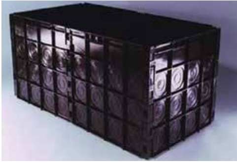
MAC Modular Access Chambers