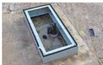
The plinth and cables after the 100 kph impact (the cables and underlying cast-in foundation unit are totally undamaged but the visible plinth is designed to be replaced)