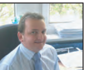
MICK RYAN Electrical Heating DRUM, IBC, SKID, PROCESS HEATERS

Thorne & Derrick UK are national distributors of LV-HV Cable Installation, Jointing & Electrical Eqpt. to enable the installation, jointing, termination, glanding, earthing, cleating, laying and duct sealing of electrical services from 415v to 33kV.