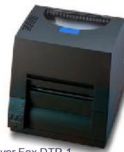
Silver Fox DTP-1