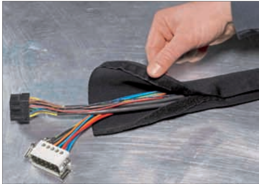
HELAHOOK protective sleeving allows for retrospective fitting and repeated use.

HELAHOOK is also employed in automobiles or commercial vehicles. It is the ideal solution for post-termination cable organisation and wherever repeated use is a necessity.