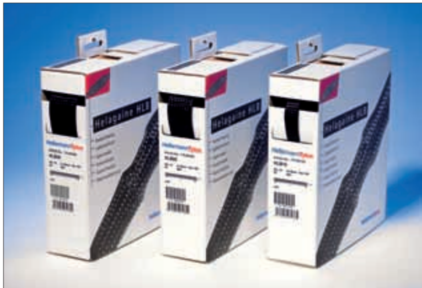
Helagaine HLB: The expansion rate makes it possible. Only three sizes in a handy dispenser box for almost all standard diameters.

To prevent fraying, the sleeve is cut with a hot-cutting tool, which melts and cleanly fuses the ends of the yarn