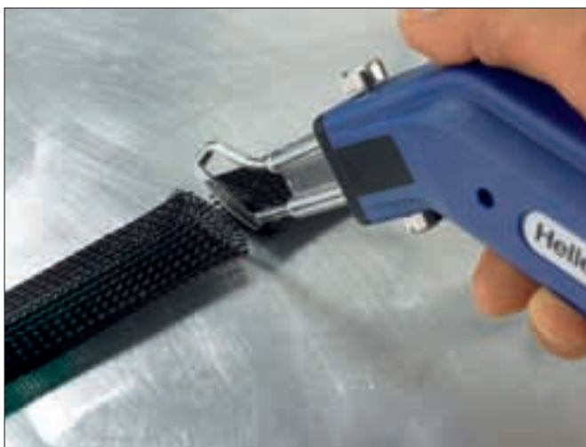
The HSG0 hot cutting tool prevents the braided sleeving from fraying.

The HSG0 hot cutting tool is a light, robust, hand-held device to cut synthetic fabrics such as braided sleeving. It heats up quickly with the press of a button and cuts the sleeving cleanly in a matter of seconds. The individual strands melt and fuse together, preventing the sleeving from fraying.