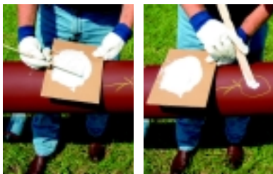
Protal cartridge pack application.