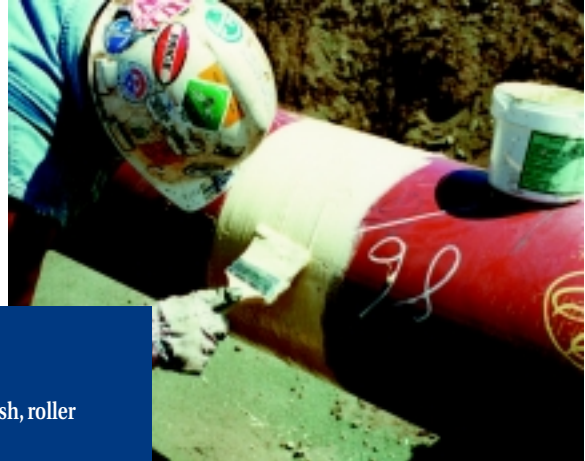
Protal hand application.