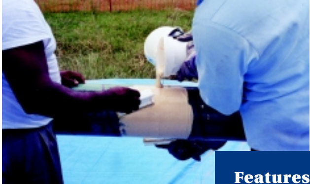
Protal applicator pad application.