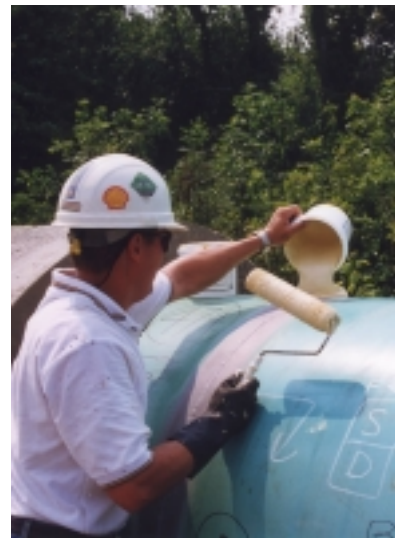
Protal being poured onto pipe.