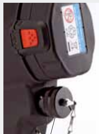
Socket for 12÷14.4 V dc external power supply