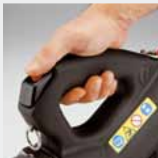
Easy to operate with only one hand