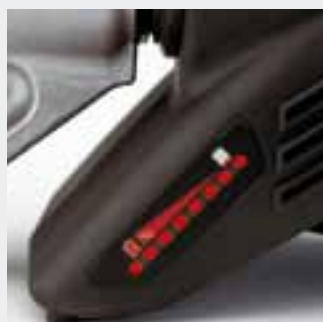
Battery condition display