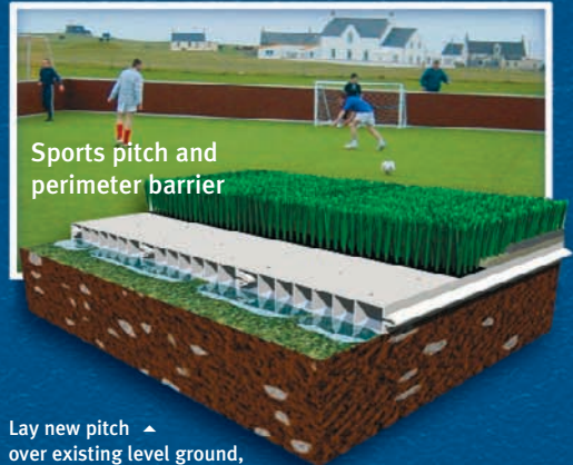
Sports pitch and perimeter barrier

Lay new pitch ▲ over existing level ground, save time and money.