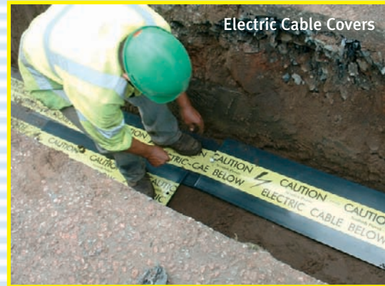
Electric Cable Covers

Approved by utilities worldwide. Stokbord Cable Covers meet the impact requirements of BS2484, 1985 Paragraph 4 Appendix A. Complies with EATS 12-23