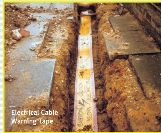
Electrical Cable Warning Tape