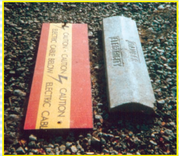
▲ STOKBORD® alternative to the traditional concrete protection (shown right)