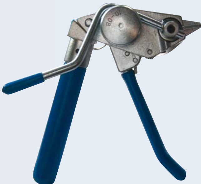
■ C075 Bantam Tool

PPA Coated BAND-FAST™ Clamps – CAN YOU AFFORD TO IGNORE THE ADVANTAGES?