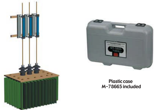
Plastic case M-78665 included